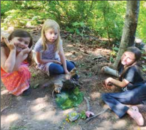
Your generosity supported Girl Scouts of Alaska Summer Day Camp in Haines.