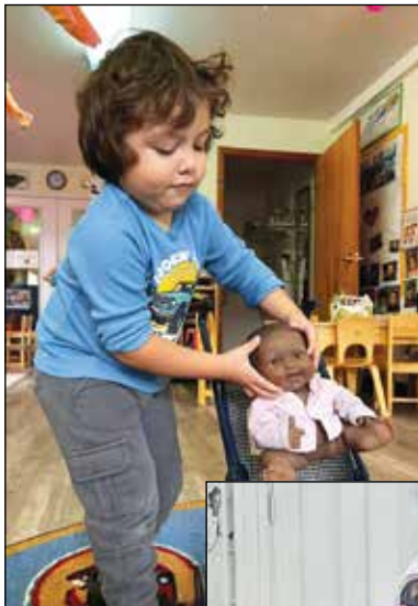
RurAl CAP's Haines Head Start