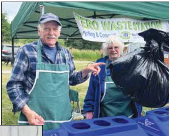
Haines Friends of Recycling