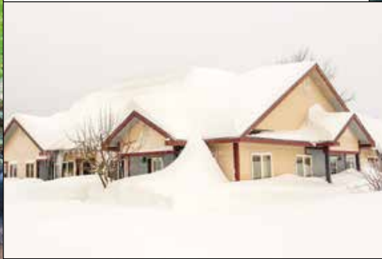
Your donation contributed to snow removal at Haines Senior Village.