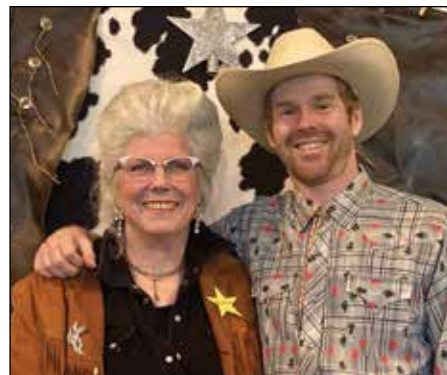
Lynn Canal Broadcasting / KHNS