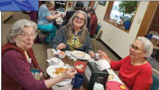
Catholic Community Service's Haines Senior Center