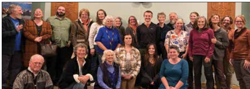
2024 CVCF grant recipient representatives

Art Jess Scholarship Fund $8,500, Call Family Fund $334, Environmental Fund $2,512, Fitness & Wellness Fund $2,624, Memorial Fund $2,548, and CVCF General Endowment Fund $59,779.