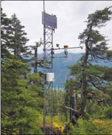
Lutak weather station

THANK YOU again to all of the generous donors who contributed to the Emergency Response Fund that was created in response to our 2020 Chilkat Valley disaster. Two final projects were accomplished with the last of the ERF funds.