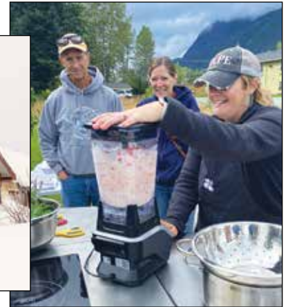
You helped fund Takshanuk Watershed Council's Local Foods Challenge.