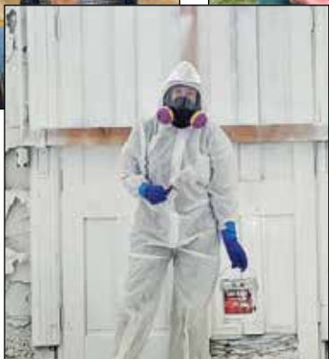
Eldred Rock Lighthouse Preservation Association