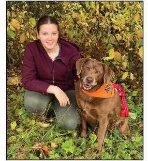
Haines Animal Rescue Kennel