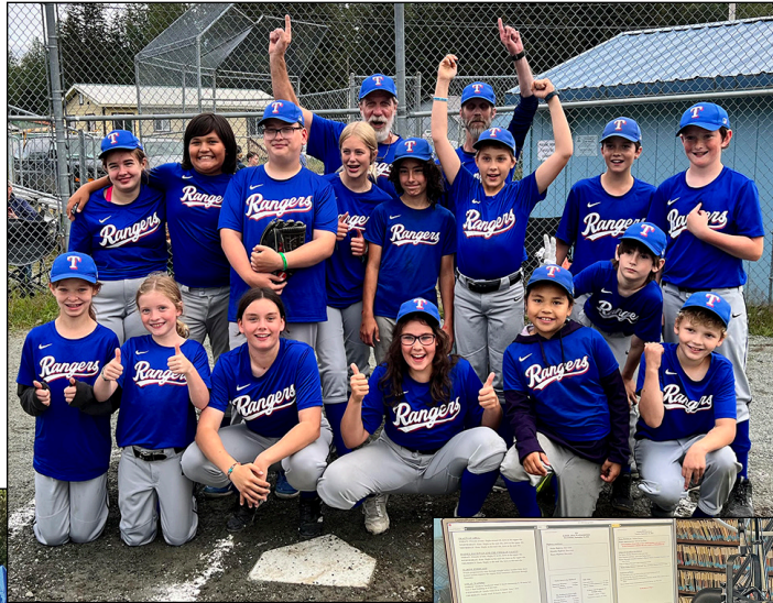
Haines Little League