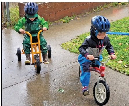
Your generosity supported RurAL CAP (Haines Head Start/Parents as Teachers).