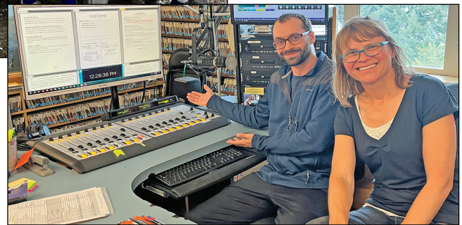
Lynn Canal Broadcasting / KHNS