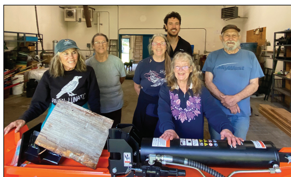
Showing off FWRC's new log splitter in their tool library

Four Winds Resource Center (FWRC) is located in Mosquito Lake, a community of 226 located 26 miles up the Haines Highway. When FWRC held its "Put the Garden to Bed" event this past fall in collaboration with Lynn Canal Conservation, about seventy people showed up for a day of weeding, mulching, music and potluck dining. That's impressive for a group that just obtained its 501c3 status last year! Until now, fiscal sponsorship from Takshanuk Watershed Council has allowed the group to apply for CVCF grants while moving toward having its own nonprofit status.