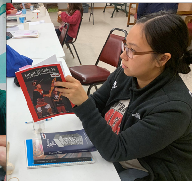
You helped fund Chilkoot Indian Association's Tlingit Language Initiative.