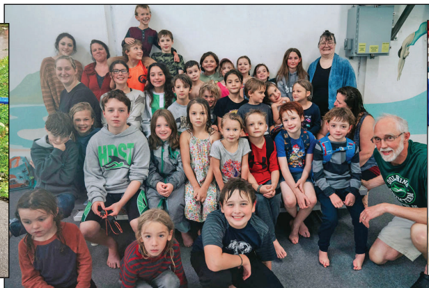
Your donation contributed to the Haines Dolphins Swim Team's operations.