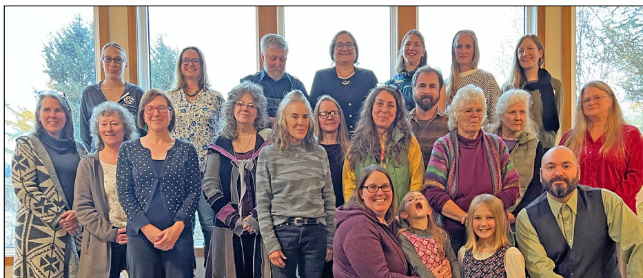
2023 CVCF grant recipient representatives

Art Jess Scholarship Fund $6,000, Environmental Fund $177, Fitness & Wellness Fund $2,107, Memorial Fund $1,070, and the balance came from the CVCF General Endowment Fund.