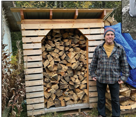
Haines Presbyterian Church / Haines Ministerial Association