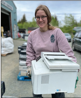
Haines Friends of Recycling