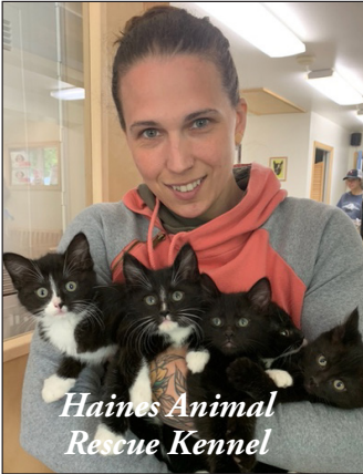
Haines Animal Rescue Kennel