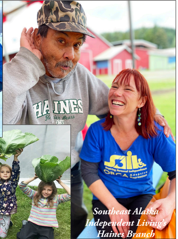
Southeast Alaska Independent Living's Haines Branch