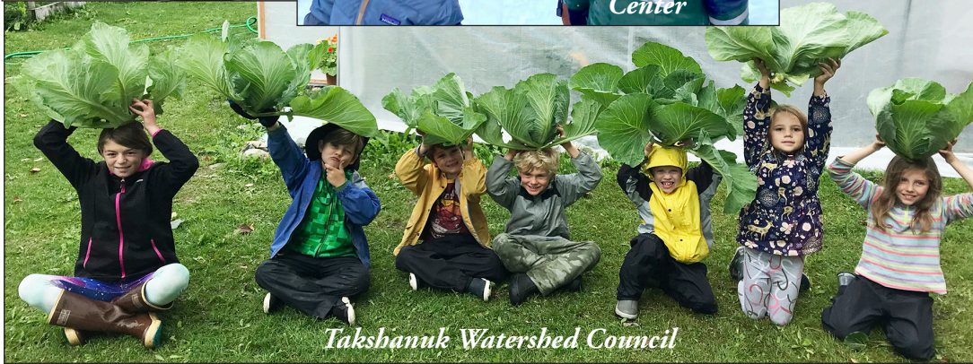
Takshanuk Watershed Council

Chilkat Valley Community Foundation An Affiliate of The Alaska Community Foundation