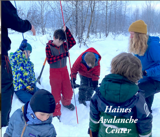
Haines Avalanche Center