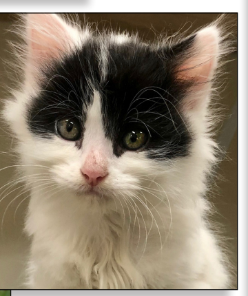
You helped fund operating support for the Haines Animal Rescue Kennel.