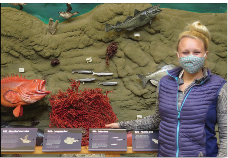
You contributed to the American Bald Eagle Foundation's diorama interpretation update.