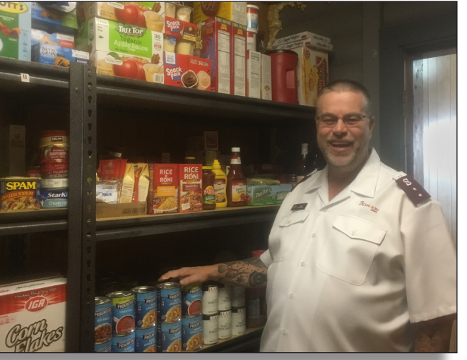
Your generosity supported the Salvation Army Haines Corps food pantry.