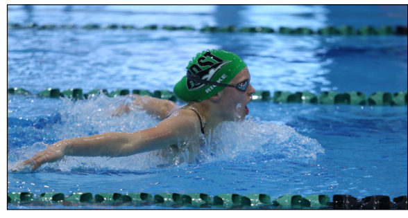
Haines Dolphins Swim Team