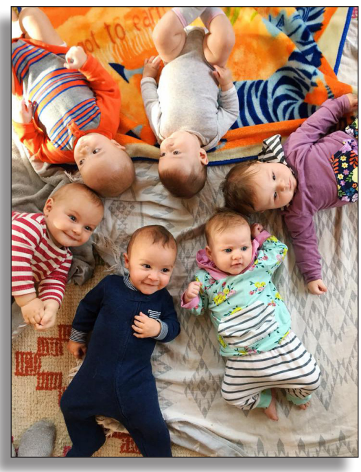
You contributed to Rural Alaska Community Action Program, Inc. infant massage classes.