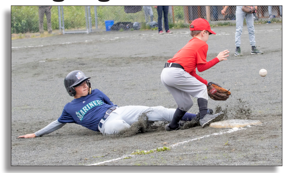
Your donations supported the Haines Little League field improvements.