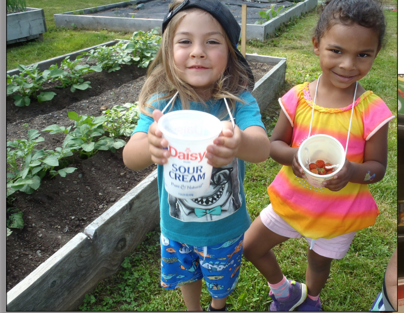
You helped fund Takshanuk Watershed Council's Starvin' Marvin Garden.