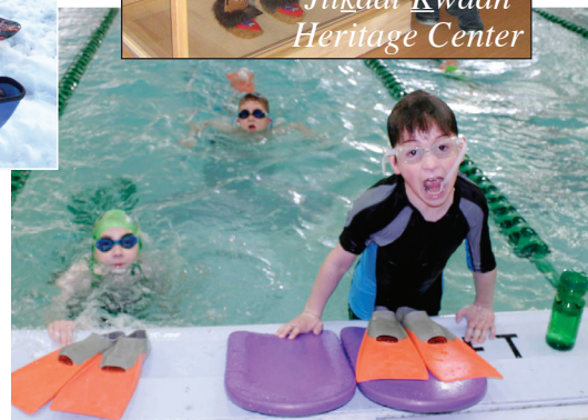
Haines Dolphins Swim Team