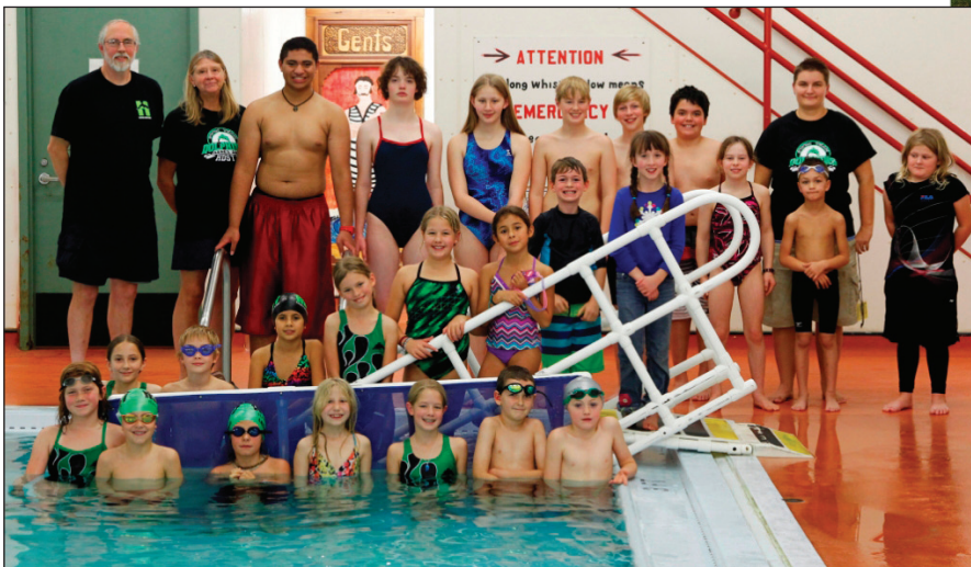
You helped the young swimmers of the Haines Dolphins Swim Team.