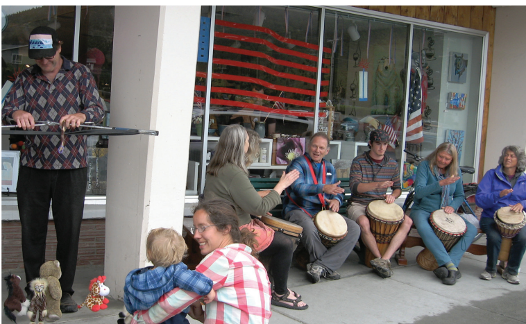
Your donations supported activities of the Alaska Arts Confluence, such as First Friday events.