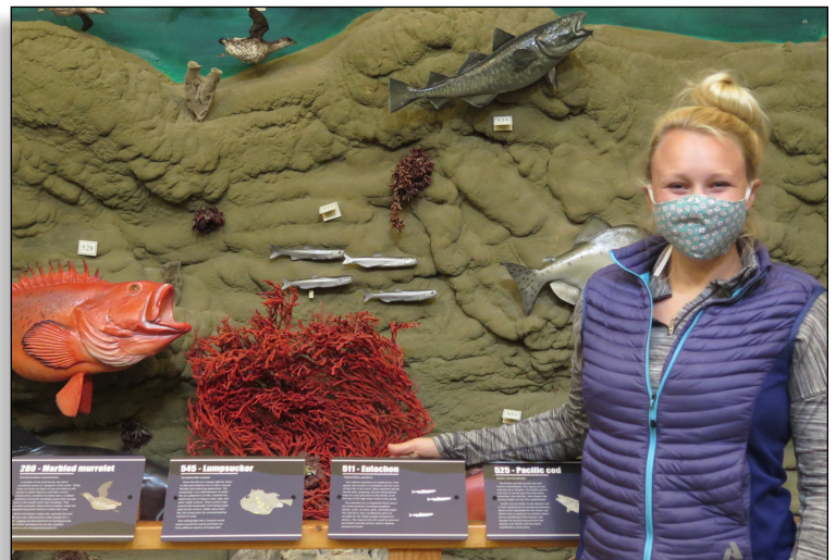
You contributed to the American Bald Eagle Foundation's diorama interpretation update.