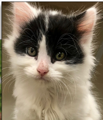
You helped fund operating support for the Haines Animal Rescue Kennel.