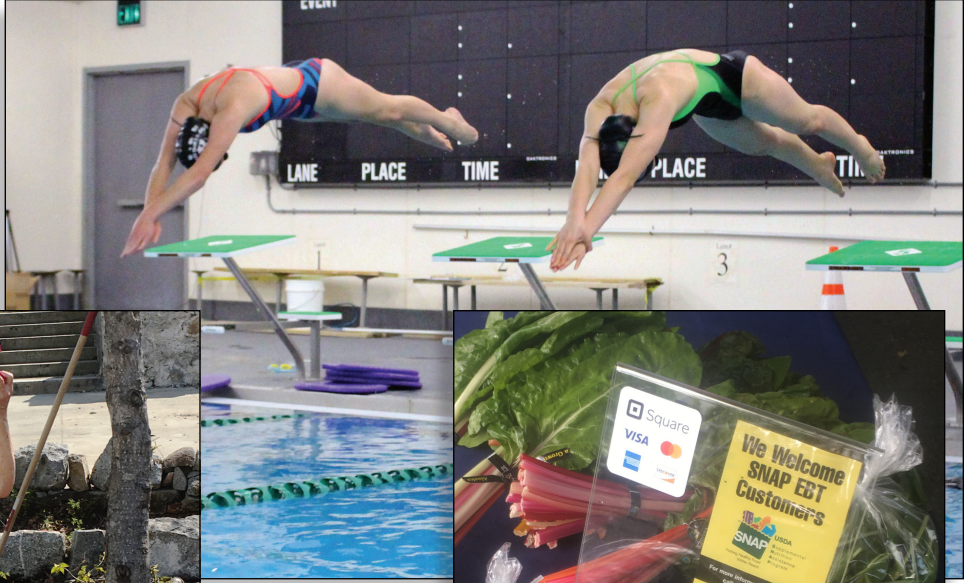
Haines Dolphins Swim Team