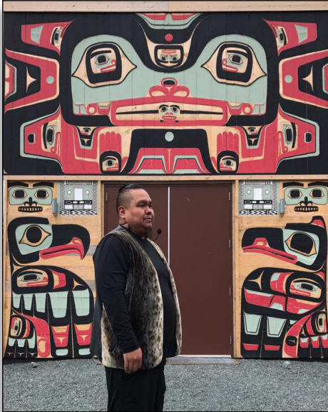
Your generosity supported operational expenses at Jilkaat Kwaan Heritage Center.