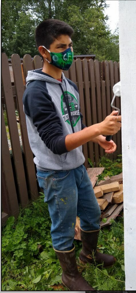
Southeast Alaska Independent Living & Takshanuk Watershed Council