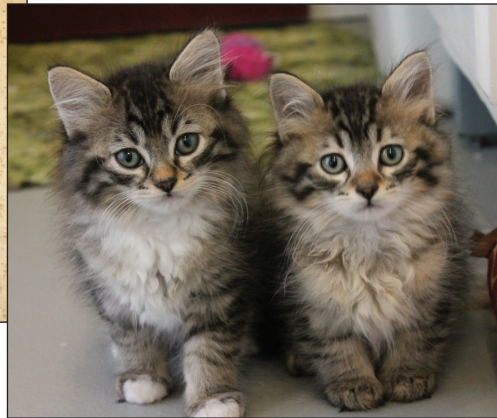
Your generosity supported HARK's Spay and Neuter Program.