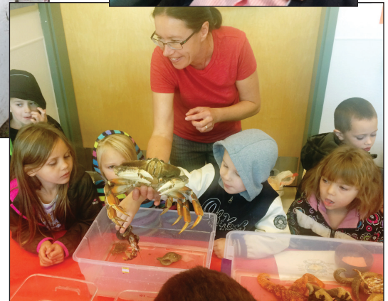
Clockwise from top left: Haines School Library Puppet Workshop, Haines Friends of Recycling, Hospice of Haines, Takshanuk Watershed Council, Chilkat Valley Preschool.