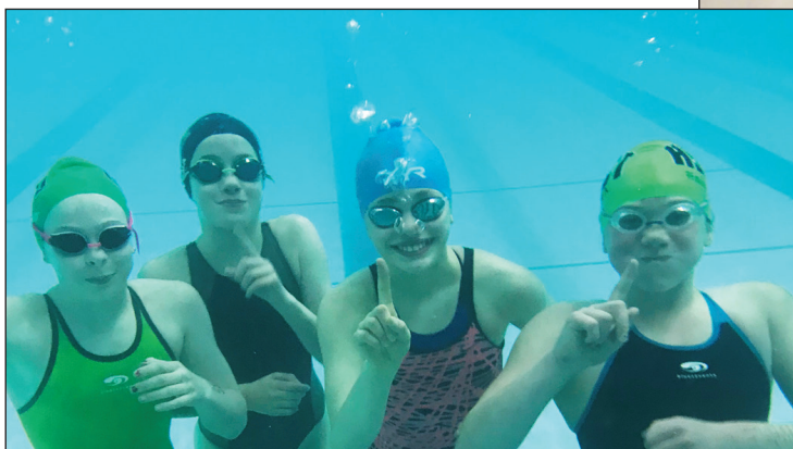
Your donations supported the Haines Dolphins Swim Team.