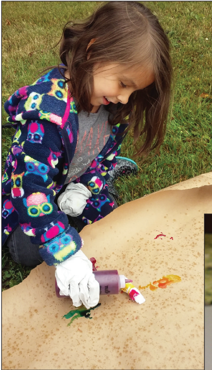
You helped fund Girl Scouts of Alaska Haines Summer Day Camp.