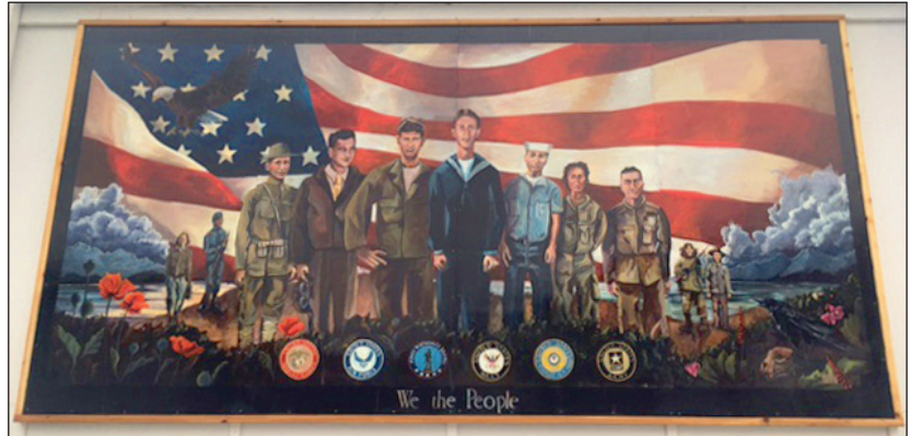
You contributed to the American Legion Post #12 Military Wall Mural.