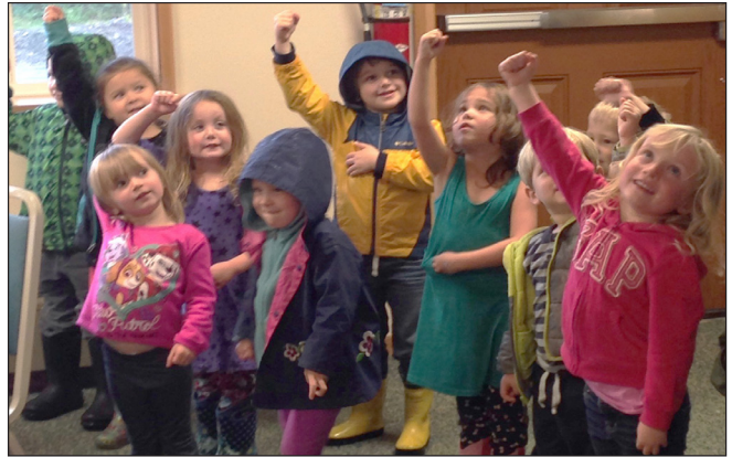
Your donations helped to build the new facility for the Chilkat Valley Preschool.