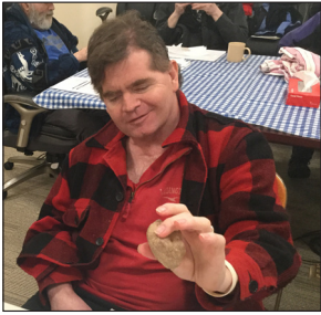
Your generosity supported SAIL's Adaptive Culinary Arts Program.