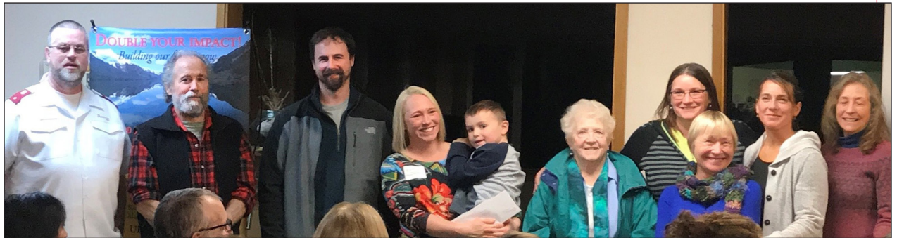
2017 Grant Awardees, Part 1