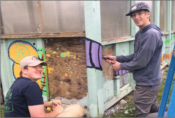
You helped fund Takshanuk Watershed Council's interns.