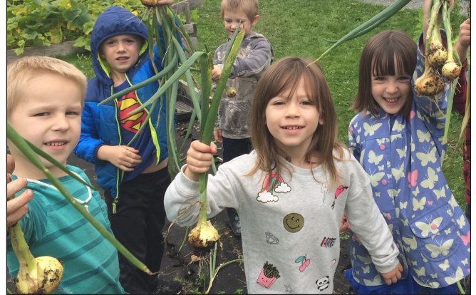
Clockwise from left: Haines Sheldon Museum & Cultural Center, Haines Dolphins Swim Team, Haines Avalanche Information Center, Takshanuk Watershed Council, Haines Friends of Recycling