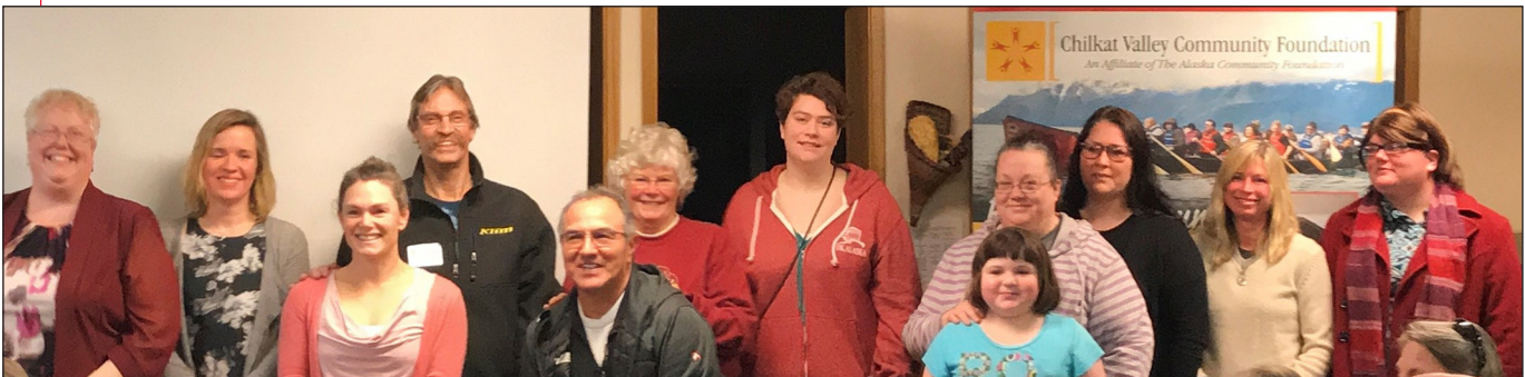
2017 Grant Awardees, Part 2

Thanks to donors like you, CVCF has already received $62,679 in donations to our various endowed funds, and all of that will be matched, making it $125,358. Your generosity is already having a measurable impact on the community we love, with grants to nonprofits that support youth activities, seniors, the arts and more. CVCF Board members and other generous friends have pledged to give every year for the next four years in order to maximize this generous match. Would you consider joining us? You can double your impact in the Chilkat Valley now!