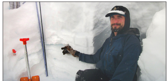
You contributed to the Haines Avalanche Information Center's operating expenses.