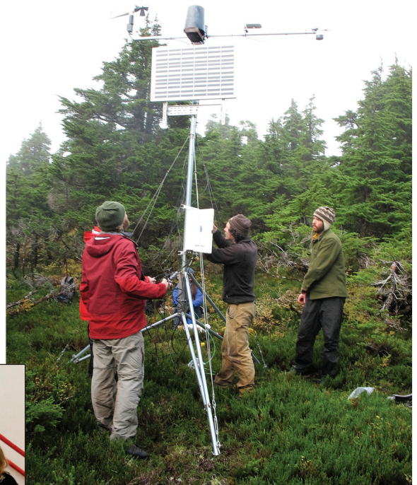
You helped build the Haines Avalanche Information Center's weather station.