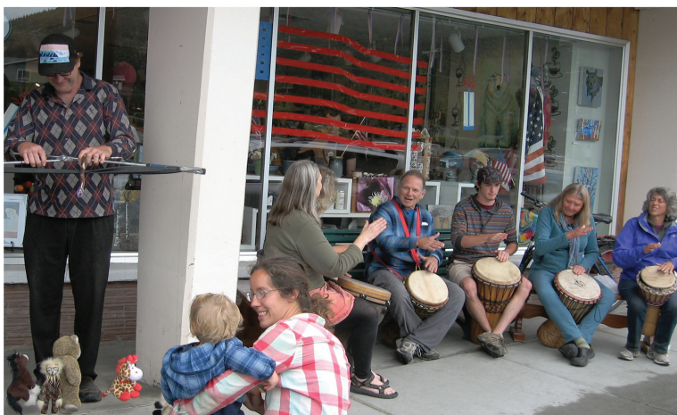
Your donations supported activities of the Alaska Arts Confluence, such as First Friday events.