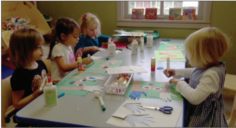
You supported fun learning activities at the Chilkat Valley Preschool.