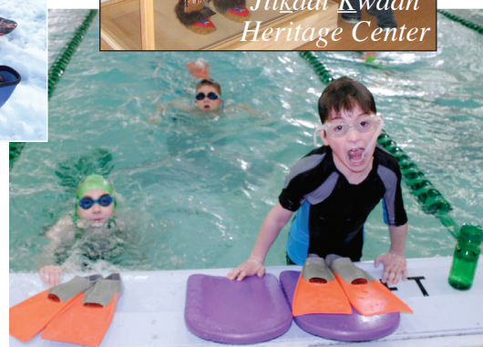
Haines Dolphins Swim Team