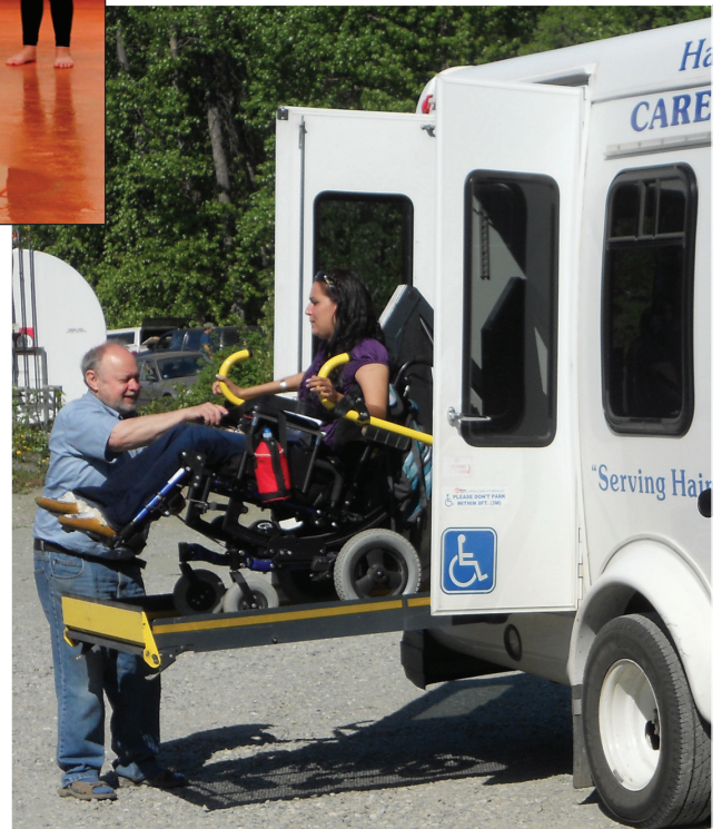
Your generosity helped with after-hours transportation of the Haines Senior Center van.