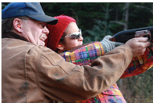
Haines Hot Shots