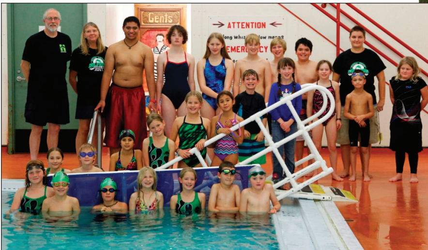
You helped the young swimmers of the Haines Dolphins Swim Team.