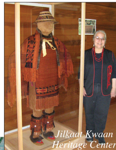
Jilkaat Kwaan Heritage Center