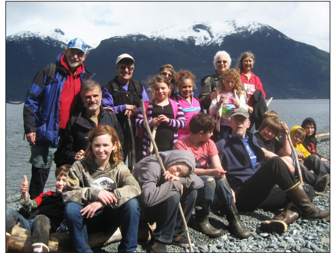
You helped Big Brothers/Big Sisters attract more volunteers for youth matches with a local media outreach program.