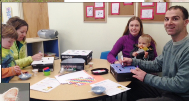
Children's Reading Foundation of Haines