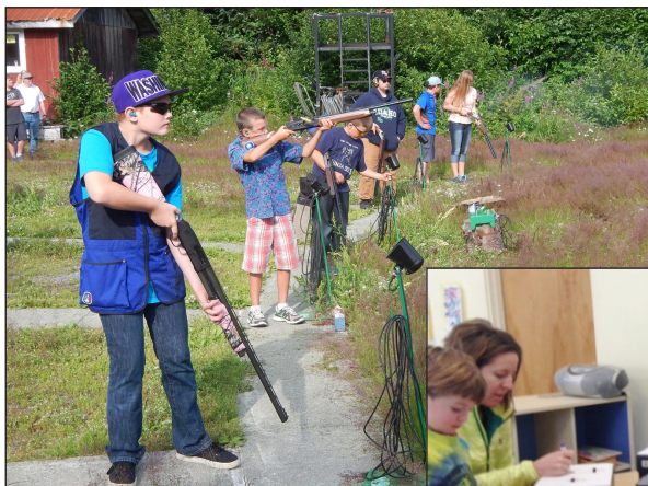
Haines Hot Shots