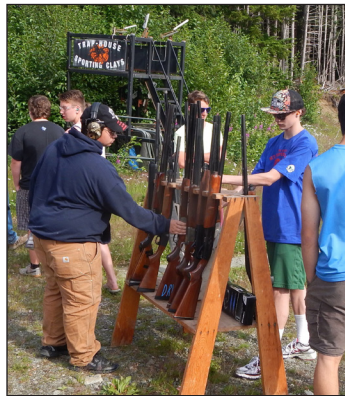
You supported youth sporting activities for the Haines Hot Shots skeet shooting program.