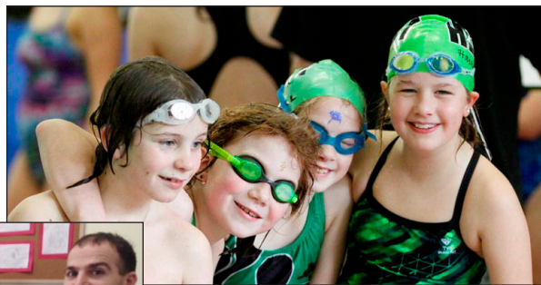
Haines Dolphins Swim Team