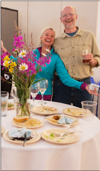
You helped the Foundation for the Chilkat Center for the Arts purchase adjustable round tables for special events.